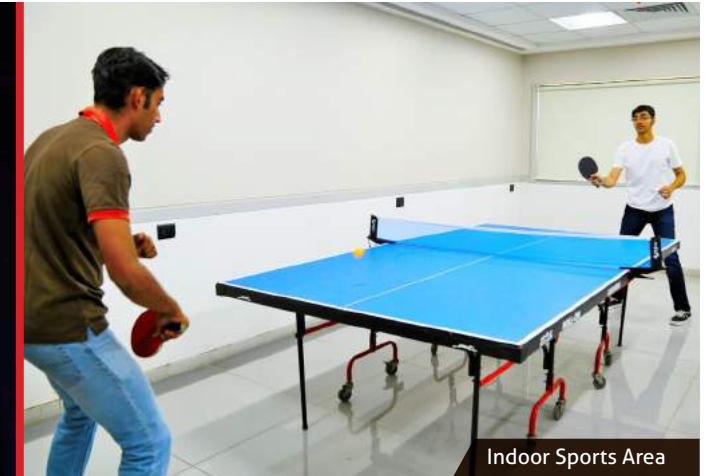
Indoor Sports Area