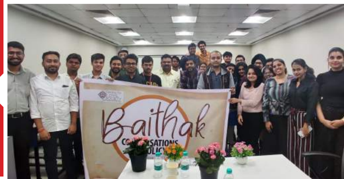
SOLink - Publication Committee

We at Kirit P. Mehta School of Law, encourage students to participate in activities that further enhance their growth through complementary learning outside the traditional classrooms.