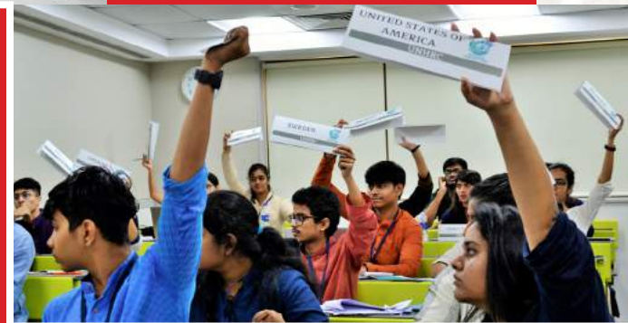
Model United Nations (MUN 2019)