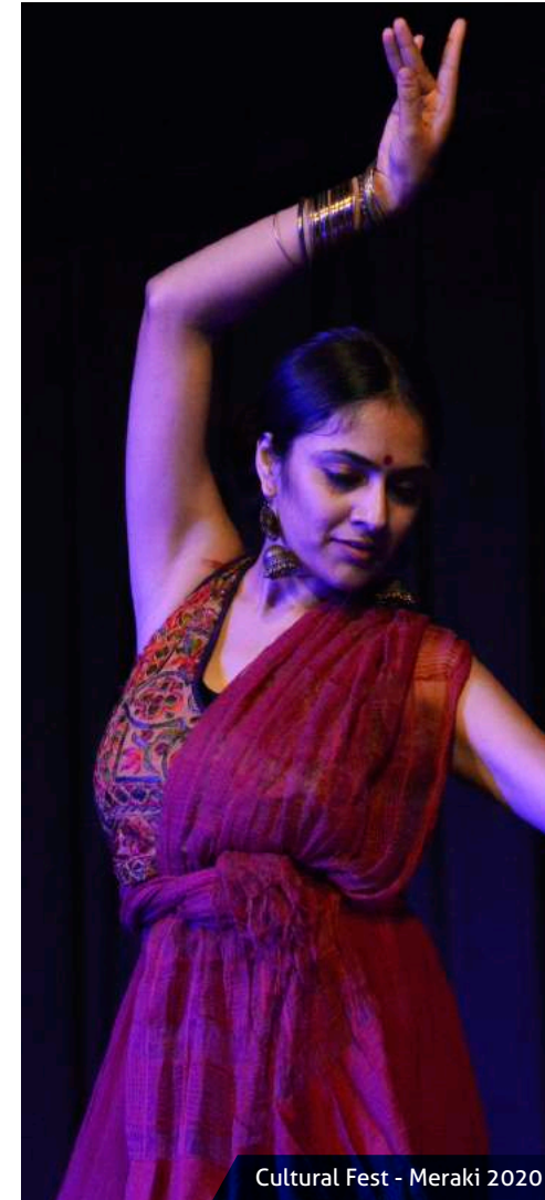
Cultural Fest - Meraki 2020